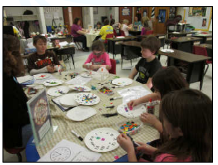
multiplication, fractions, and geometrical figures. In Science we will be working on simple machines, the water cycle, and the weather. Economics is the main topic in Social Studies. We will be reading more

chapter books in class and at home. We will continue to work in the handwriting books and begin writing in cursive all the time by the end of the 9 weeks we hope.